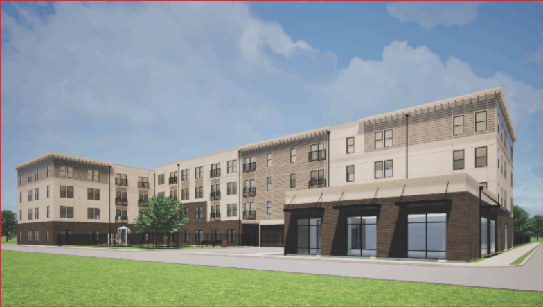
MAZANT ROYAL 4100 ROYAL STREEET NEW ORLEANS, LA 70117

Bid Date: Wednesday, January 14, 2026 | 2:00pm