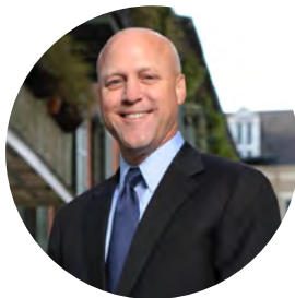
Mitch Landrieu Former Senior Advisor to the President, Infrastructure Lead