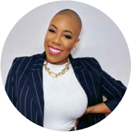
Symone Sanders Townsend Political Strategist and Commentator, MSNBC