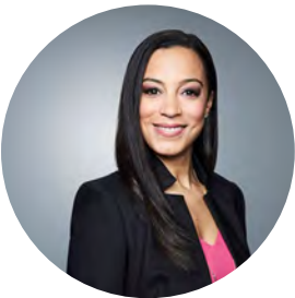
Angela Rye Former CNN Commentator