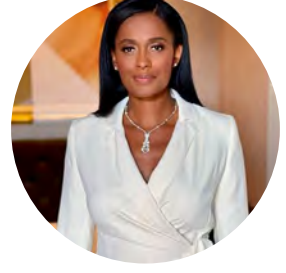
Swin Cash Former WNBA Star and New Orleans Pelicans VP