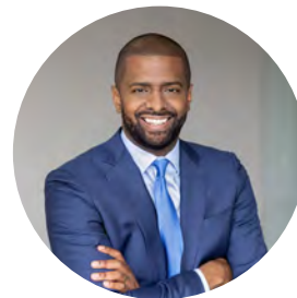
Bakari Sellers CNN Commentator