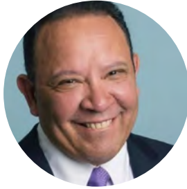
Marc Morial CEO, National Urban League