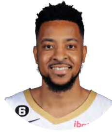
CJ McCollum NBA Star