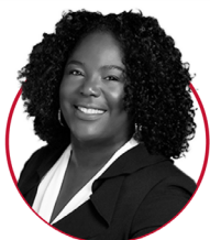
HB431 AUTHOR REP. DELISHA BOYD

Establishes a state minimum wage rate starting in 2025 and increases every two years through 2029. Also requires each city, parish, and district clerk of court to maintain a docket of cases to be filed and submitted monthly to the LA Workforce Commission (LWC).