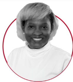
BILL AUTHOR REP. JOY WALTERS

Aims to increase community policing efforts and create safer communities by amending RS 40:2404. The proposed bill would modify the Council of Peace Officer Standard and Training by mandating the inclusion community stakeholders. The proposed bill also requires all law enforcement officers to participate in quarterly de-escalation trainings.